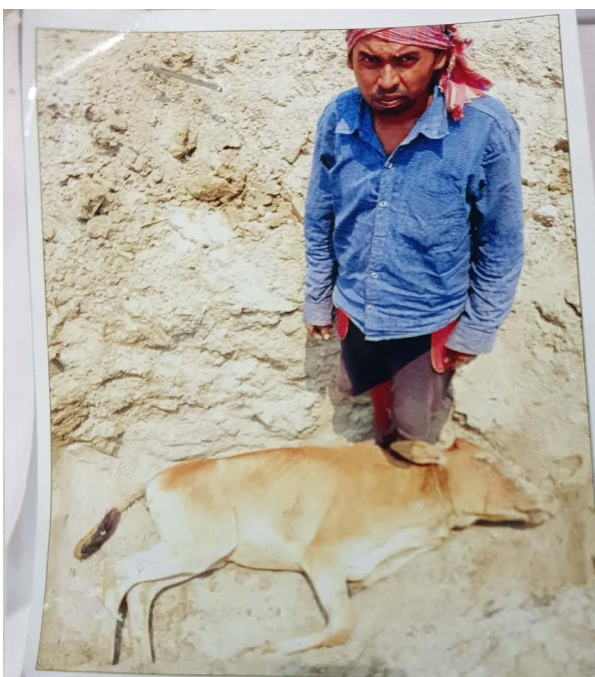
Picture of victim