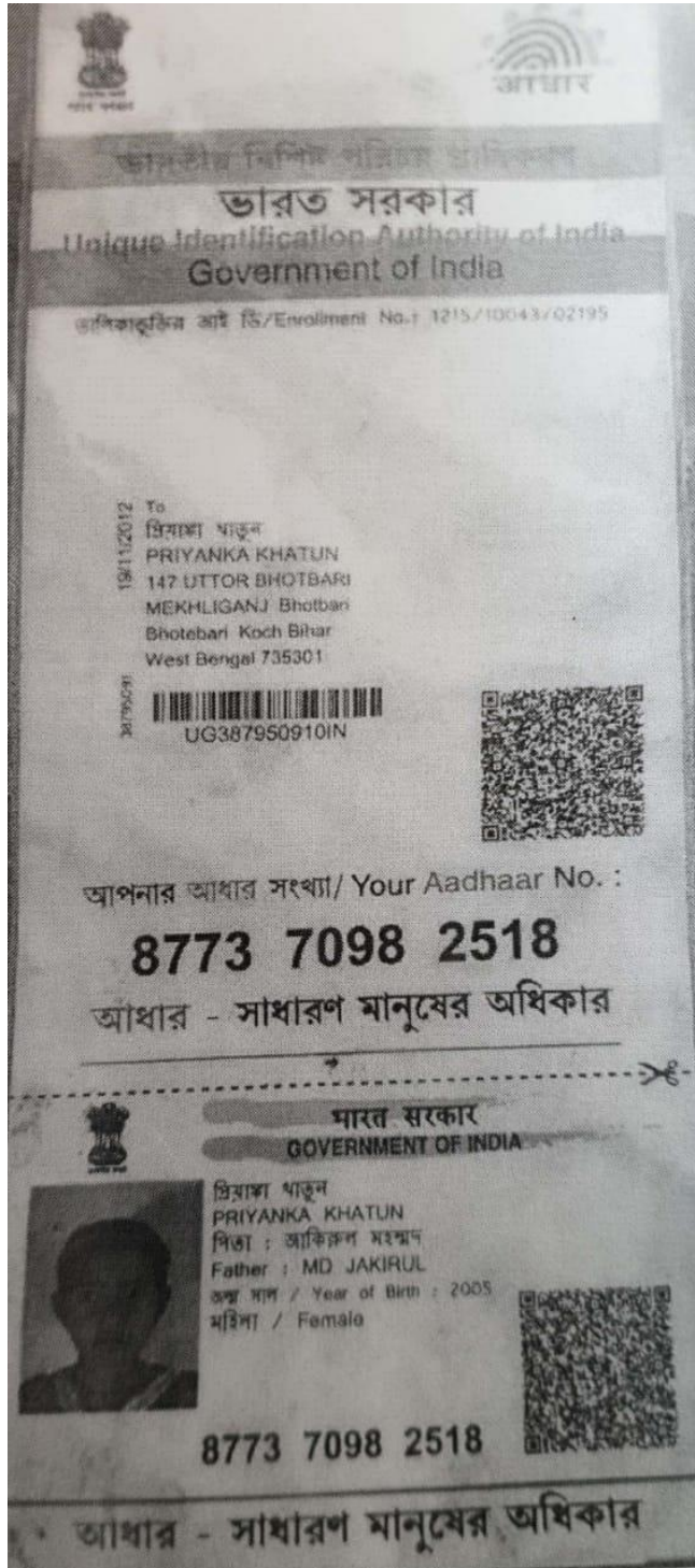
Adhaar Card of victim