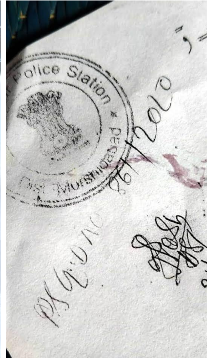
Police GD Entry receipt