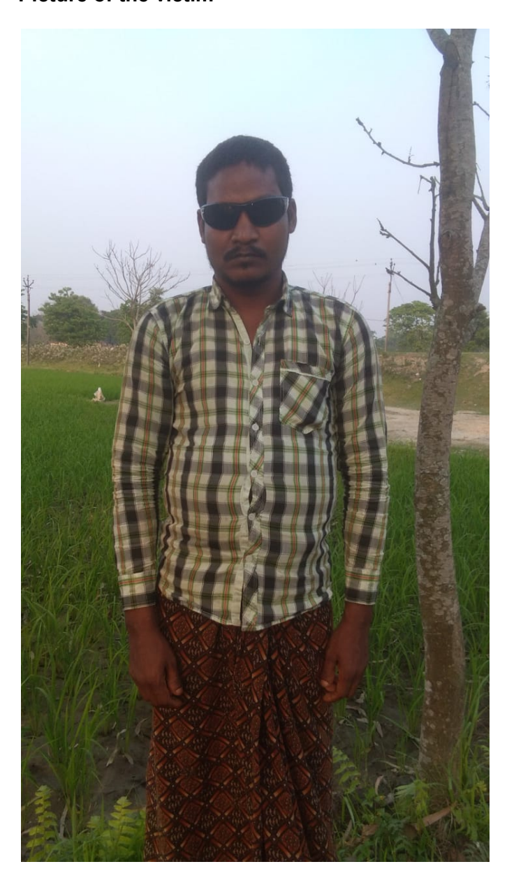
Victim's Statement https://youtu.be/MGvLq7BJ7JE