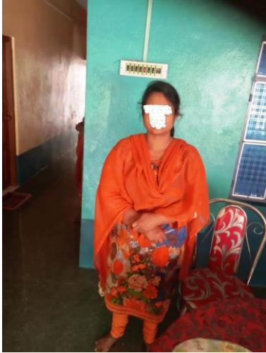
(Edited) Picture of victim