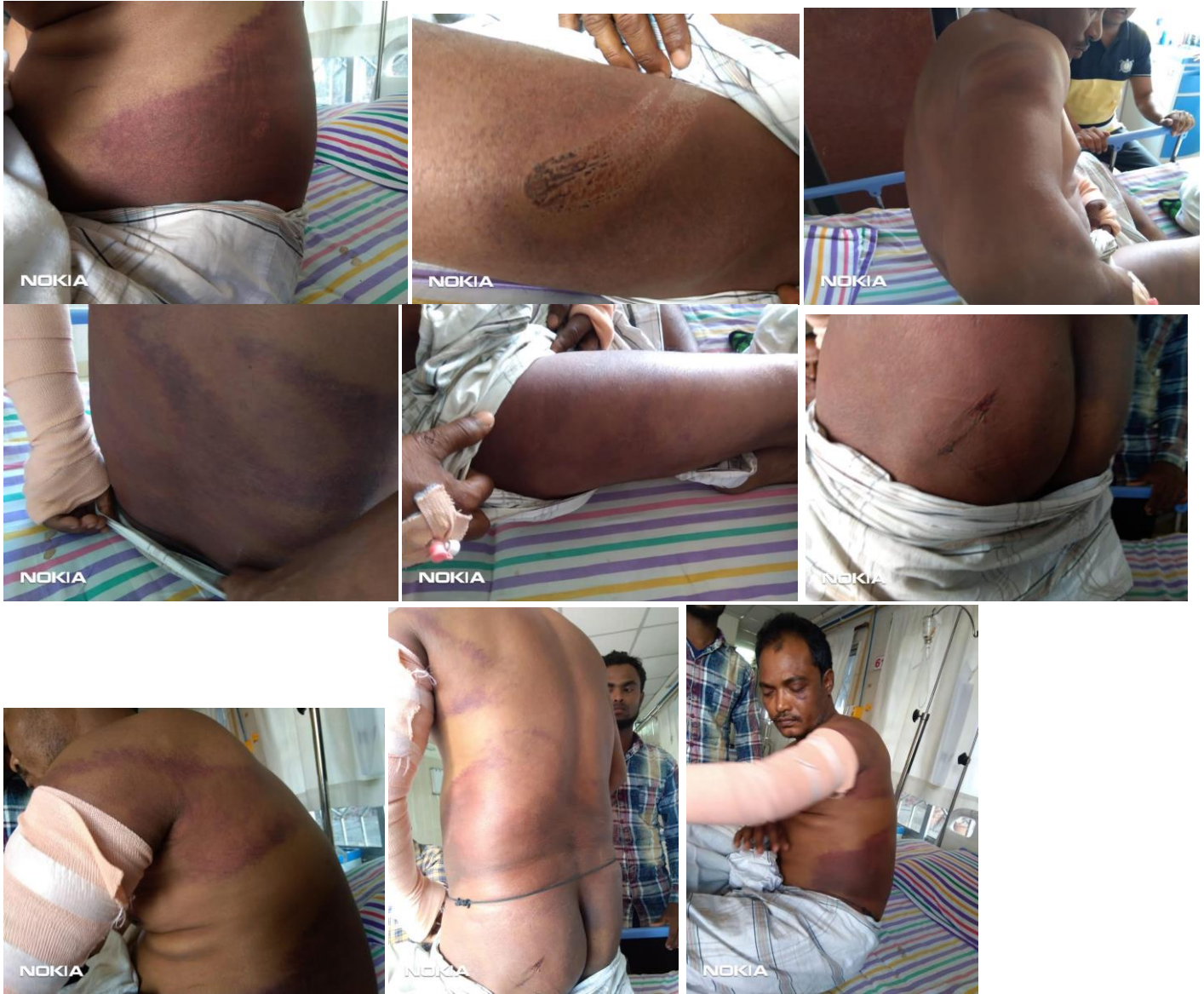
Marks of inhuman torture by BSF personnel