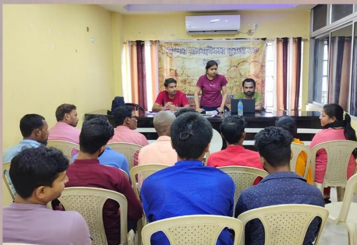
Training for the volunteers of North Dinajpur district at Raiganj