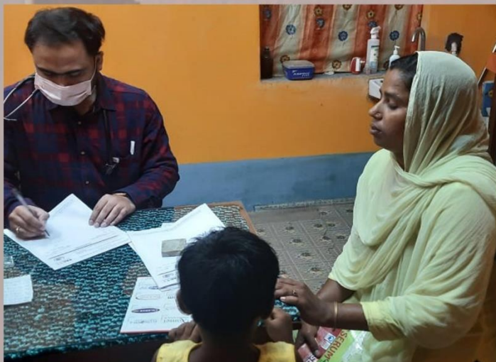
Treatment of a survivor in our medical camp aided by UNFVT