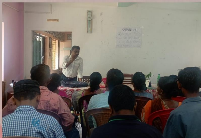
Training for the volunteers of North 24 Parganas district at Gobordanga