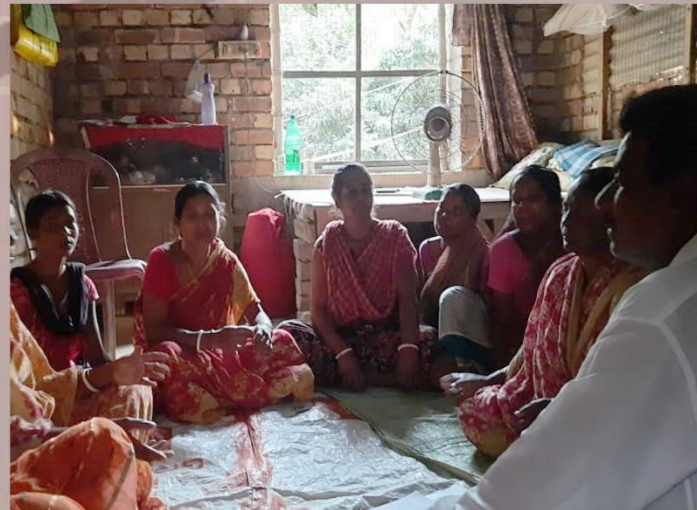
Meeting with the members of 'Promila Bahini' from Charuigachhi village of North 24 Parganas district