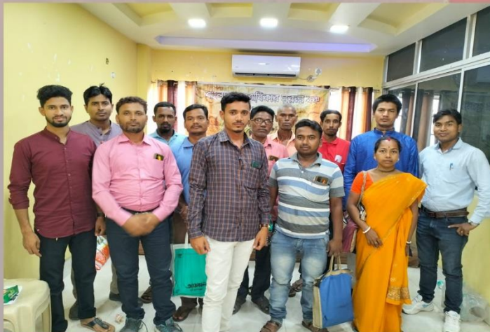
The volunteers who will be working in North Dinajpur district since June, 2023