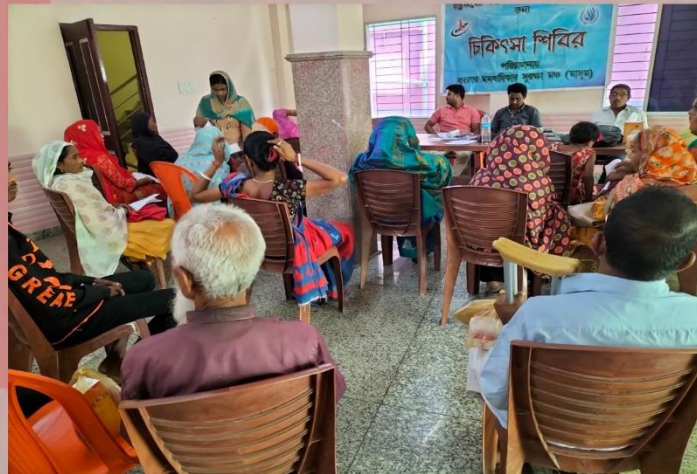
Meeting with the torture survivors of Cooch Behar district after the medical camp