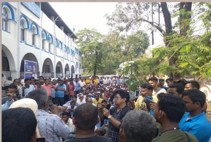
Deputation at Cooch Behar District Magistrate's office by members of 'Amra Simantabasi'