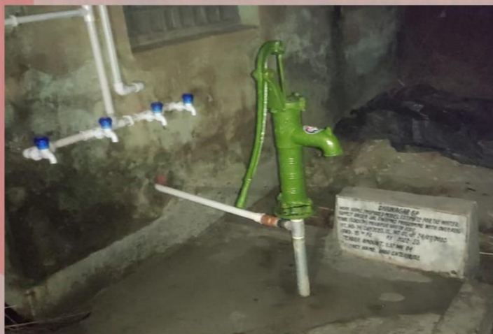
Drinking water facility installed at ICDS center of Dakkhin Paharpur village after our complaint