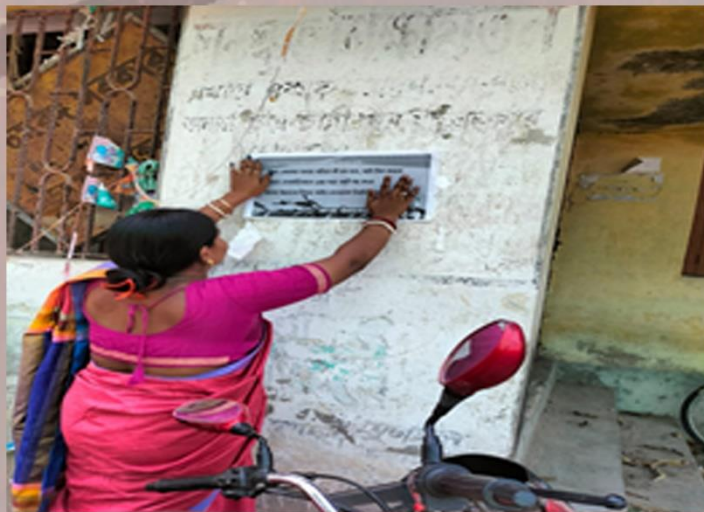
A vounteer putting up poster against illegal BSF restrictions in North 24 Parganas district