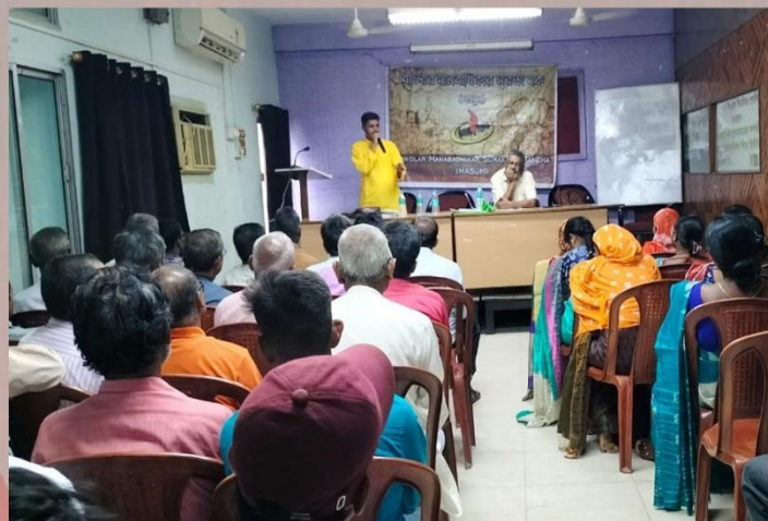
Meeting with the leadership of 'Amra Simantabasi' committees of North Dinajpur district