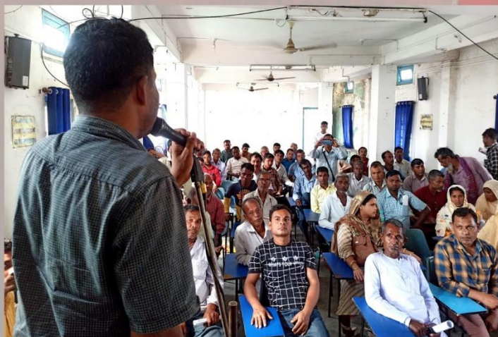
Meeting with the village level leaders of Cooch Behar district